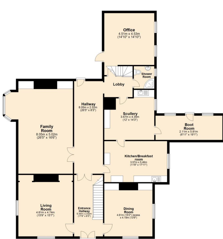
Ground Floor Approx. 204.3 sq. metres (2198.7 sq. feet)